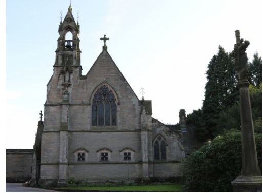
The Catholic churches of St. John the Baptist, Great Haywood (left) and Our Lady of the Assumption, Swynnerton (right).

Our next Discovery Day will focus on sites associated with some of the Recusant families whose faith and courage helped to maintain and support Catholic communities in Staffordshire after the Reformation.