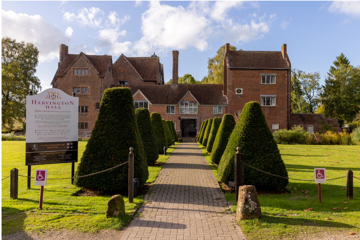
Our first Discovery Day of 2023 begins with a visit to Harvington Hall on the Feast of the English Martyrs.

Discovery Days offer an opportunity for priests to enjoy a relaxed day out, in the company of other priests, exploring places of interest within, and beyond, the Archdiocese, accompanied by myself. We anticipate that each day will attract a small group, and they are limited to priests only.