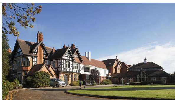
Woodland Grange, venue for The Synod for Priests.

Opening with a reflection on the gift of a priestly vocation - remembering the God who calls us - we will then look to the ways in which we can remain faithful to the mission entrusted to us. The Holy Father urges "that our first great desire be for a united Church, a sign of unity and communion, which becomes a leaven for a reconciled world." 1 As we look to the future of our Archdiocese, we will then explore how this might look and how we can work co-responsibly with each other and those within our parishes.